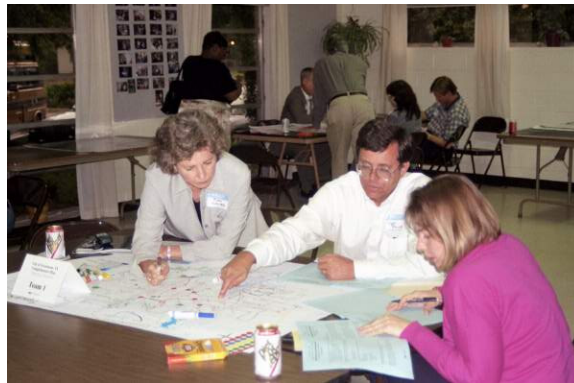
Residents of Texarkana taking part in the Visioning Charrette.

Information from the Focus Session was used as a basis for the follow-up “Policy Planning Charrette” workshop held on May 2, 2000. Participants collaborated all evening in study groups with detailed “Workbooks” to develop community policies and “action steps” that address the critical issues facing Texarkana during the policy-planning workshop. Participants also addressed issues graphically by transferring ideas to maps of different areas of the city. The issues were discussed in terms of both the near-term (the immediate five-year period) and long-term plans (up to twenty years in the future).